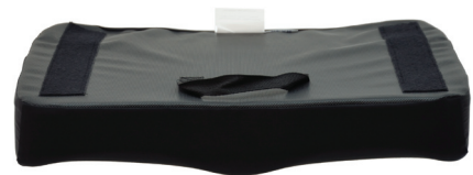
Non slip Bottom on washable, incontinent cover

Product Weight: 3 Lbs / 1.36 Kg (20"W x 20"L)