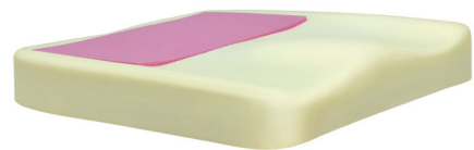
Polyurethane foam, anatomically shaped