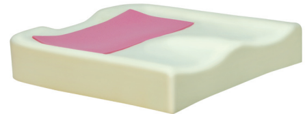
Polyurethane foam, anatomically shaped