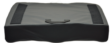
Non slip Bottom on washable, incontinent cover

Product Weight: 3 Lbs / 1.36 Kg (18"W x20"L)